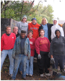
PFSN Staff— Community Care Day